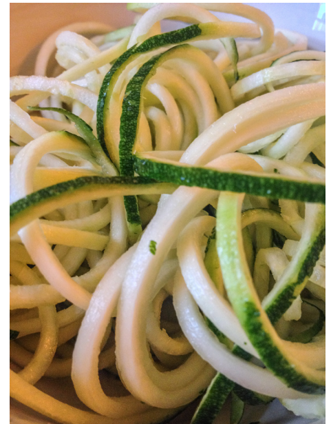
Zucchini spirals.