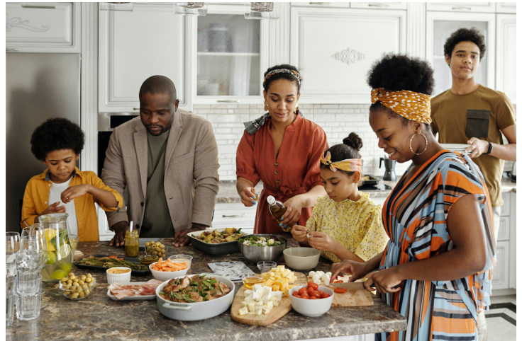
A family prepares a meal together around a kitchen counter.

The act of preparing meals as a family also has many proven benefits, such as these adapted from tunedinparents.com/2015/11/17/7-benefits-of-cooking-together-as-a-family :