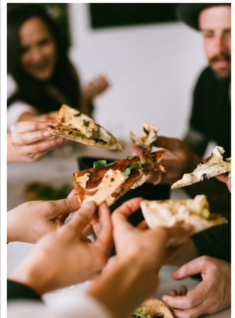
A group shares a pizza.