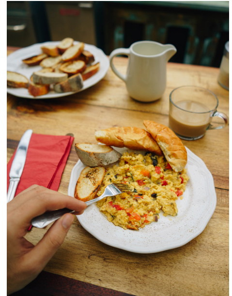
A person eating scrambled eggs off a plate..