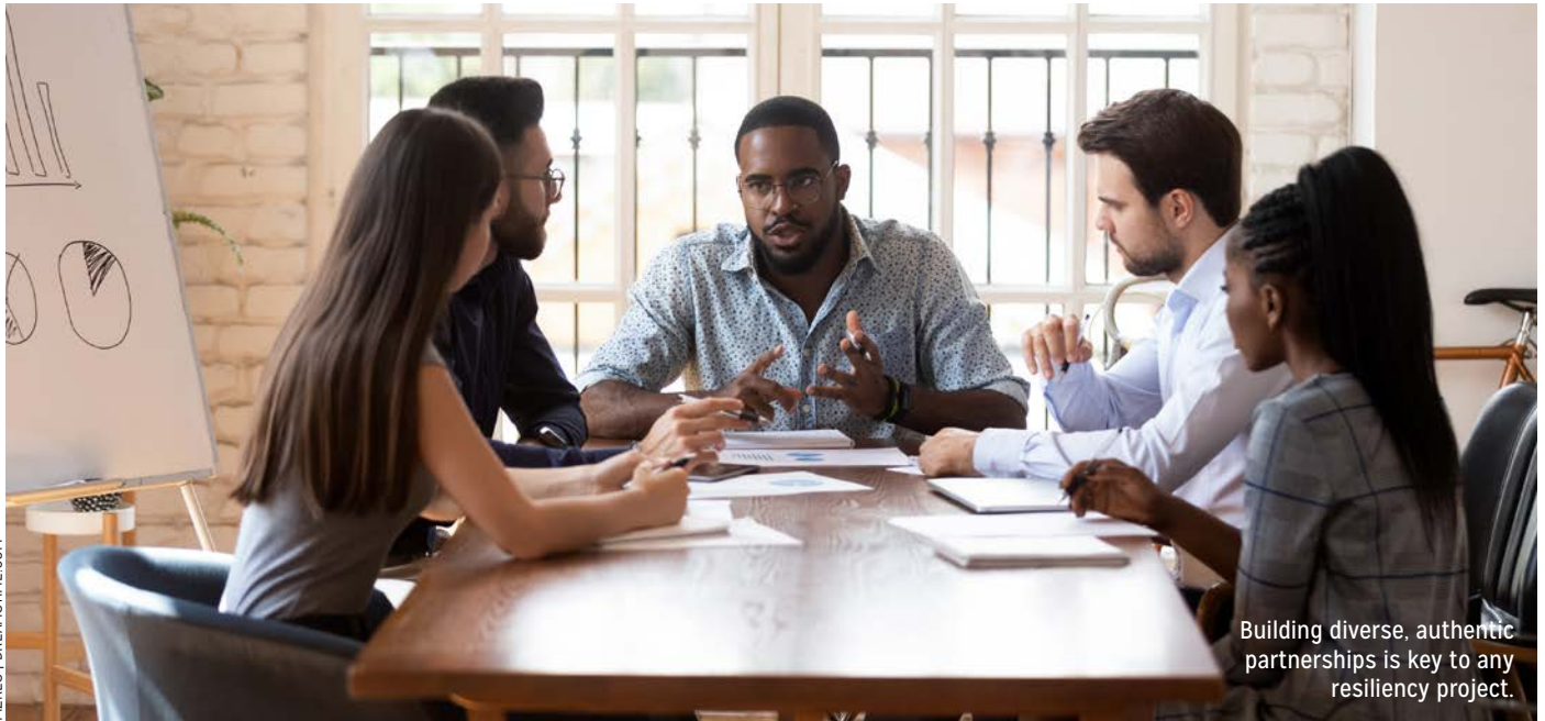
Building diverse, authentic partnerships is key to any resiliency project.