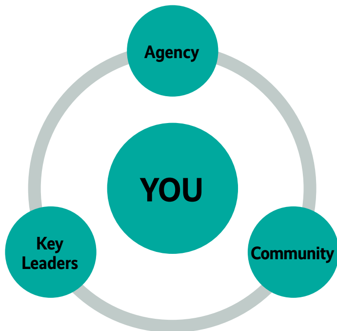
Figure 1. For successful community engagement, make sure to continuously engage these key groups.