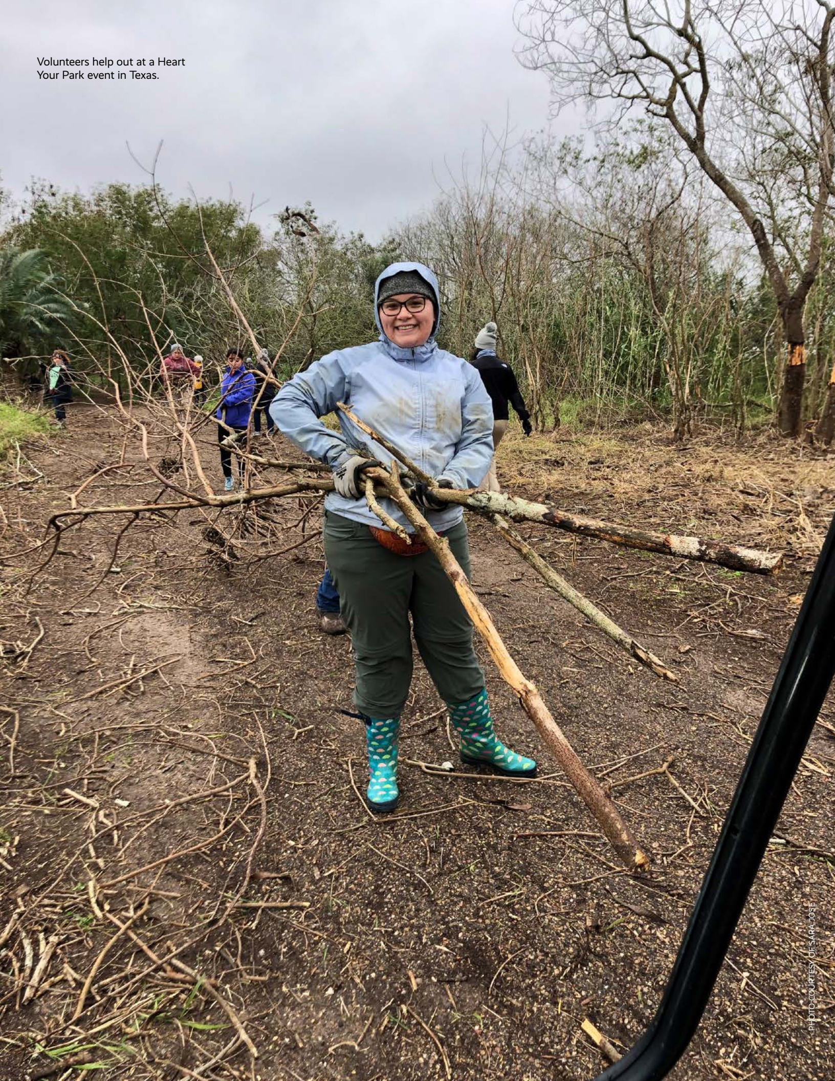
Volunteers help out at a Heart Your Park event in Texas.