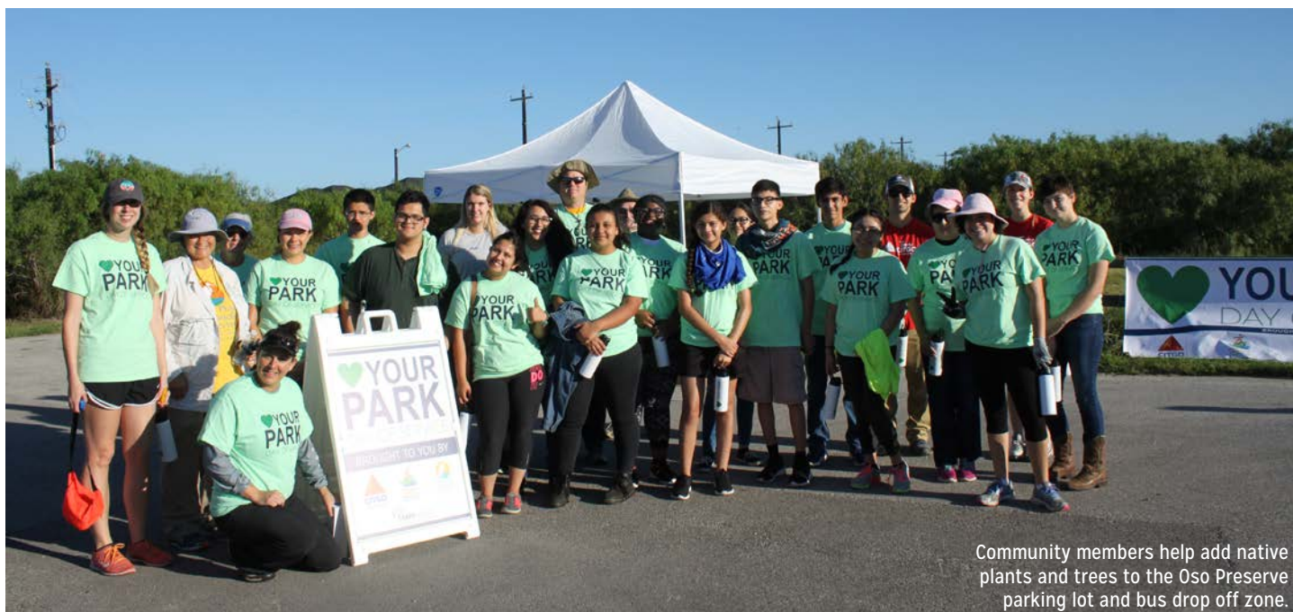
Community members help add native plants and trees to the Oso Preserve parking lot and bus drop off zone.