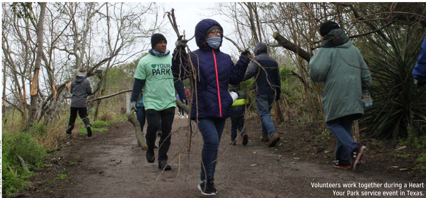
Volunteers work together during a Heart Your Park service event in Texas.