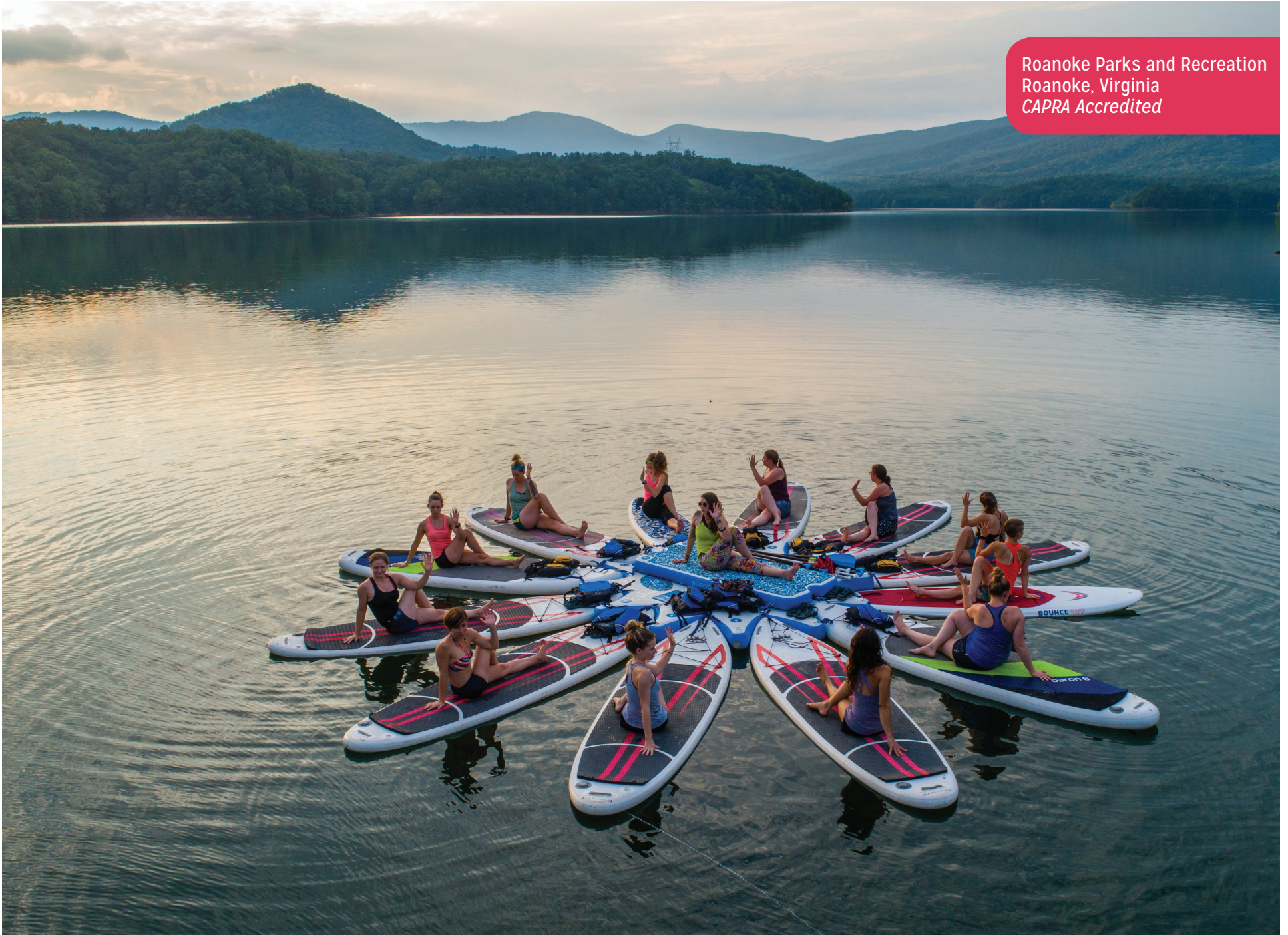
Enjoying the sunset during a stand up paddle board yoga class at Carvins Cove Natural Reserve.