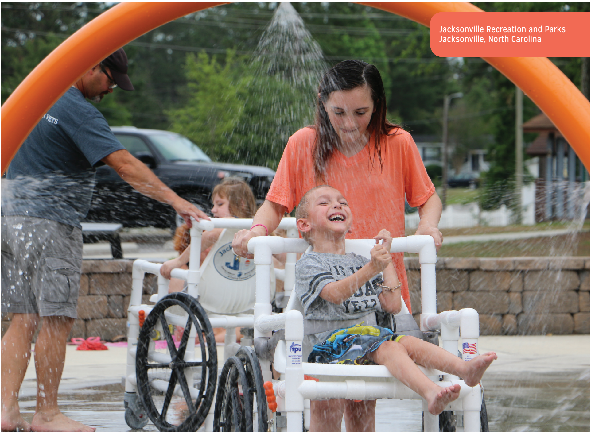
All smiles at the Northeast Creek Park Splash Pad.

Jacksonville Recreation and Parks Jacksonville, North Carolina