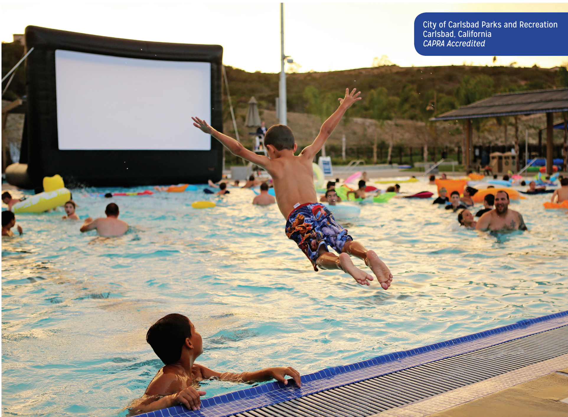
Splash into summer! Belly flop before the Float n' Flick at Alga Norte Aquatics Center.