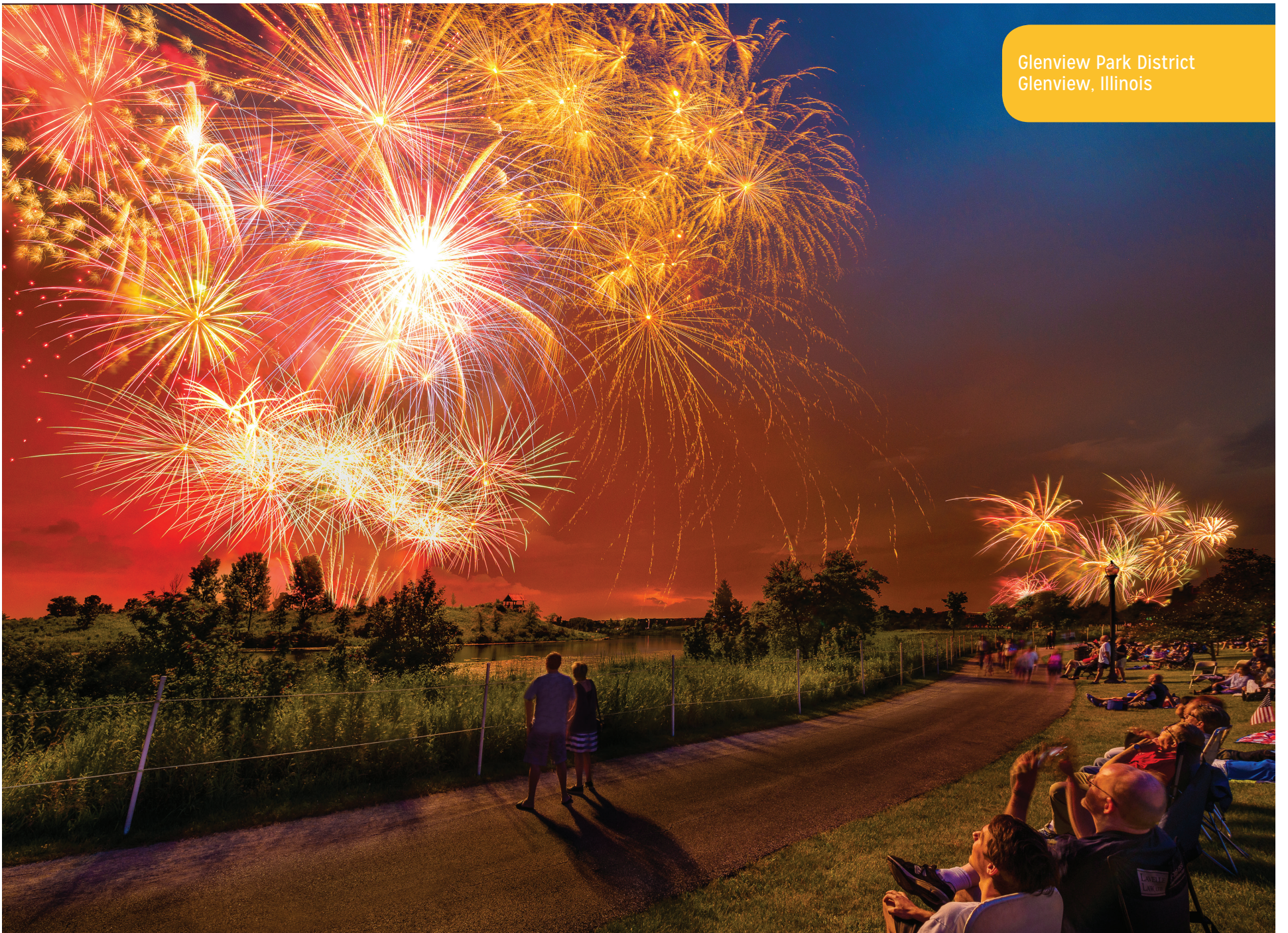
Gallery Park residents enjoying the annual Fourth of July fireworks show.