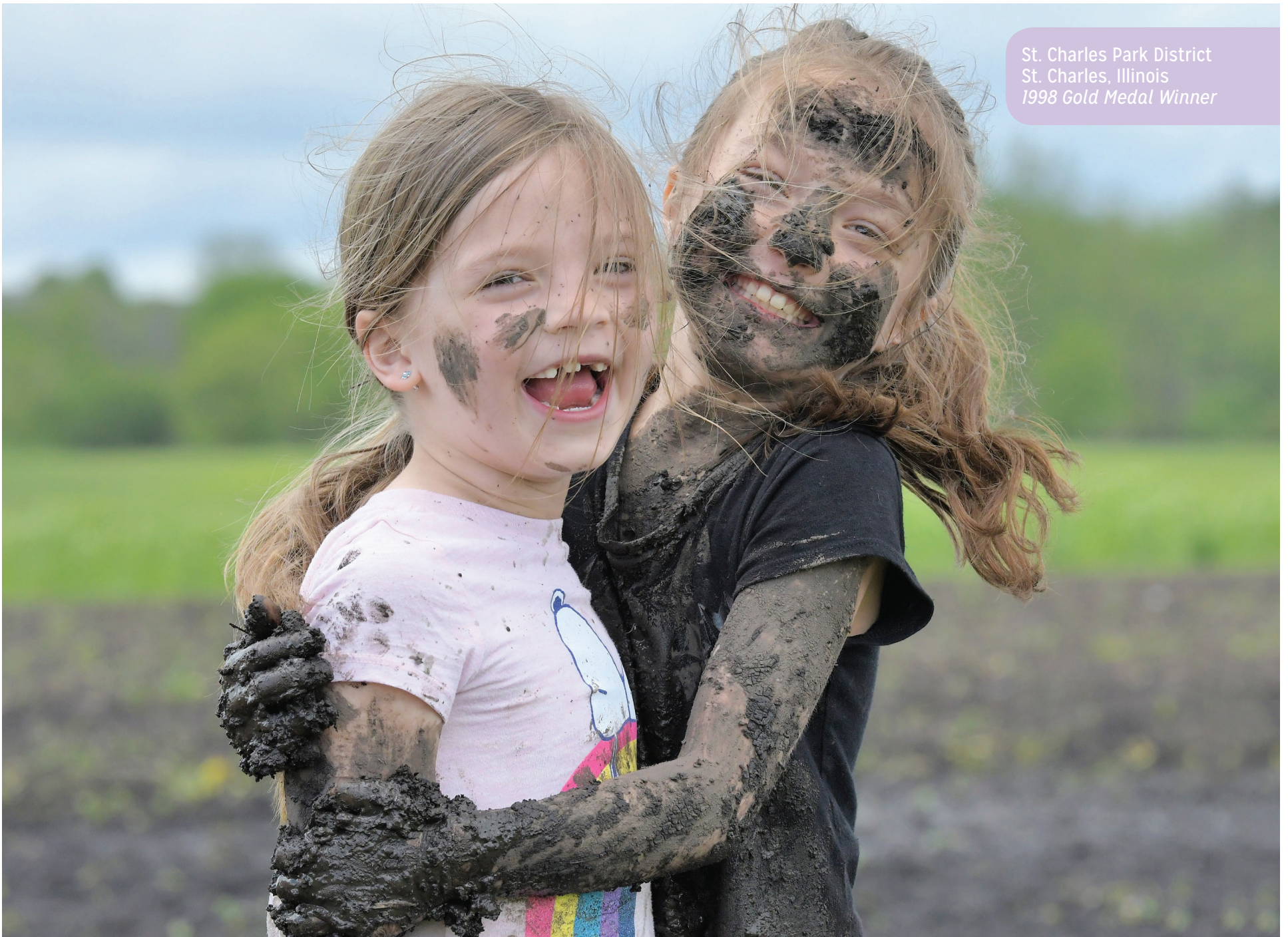
Each spring, kids enjoy squishing, scooping and exploring the outdoors while relishing in the joy of mud on International Mud Day at Primrose Farm.

St. Charles Park District St. Charles, Illinois 1998 Gold Medal Winner