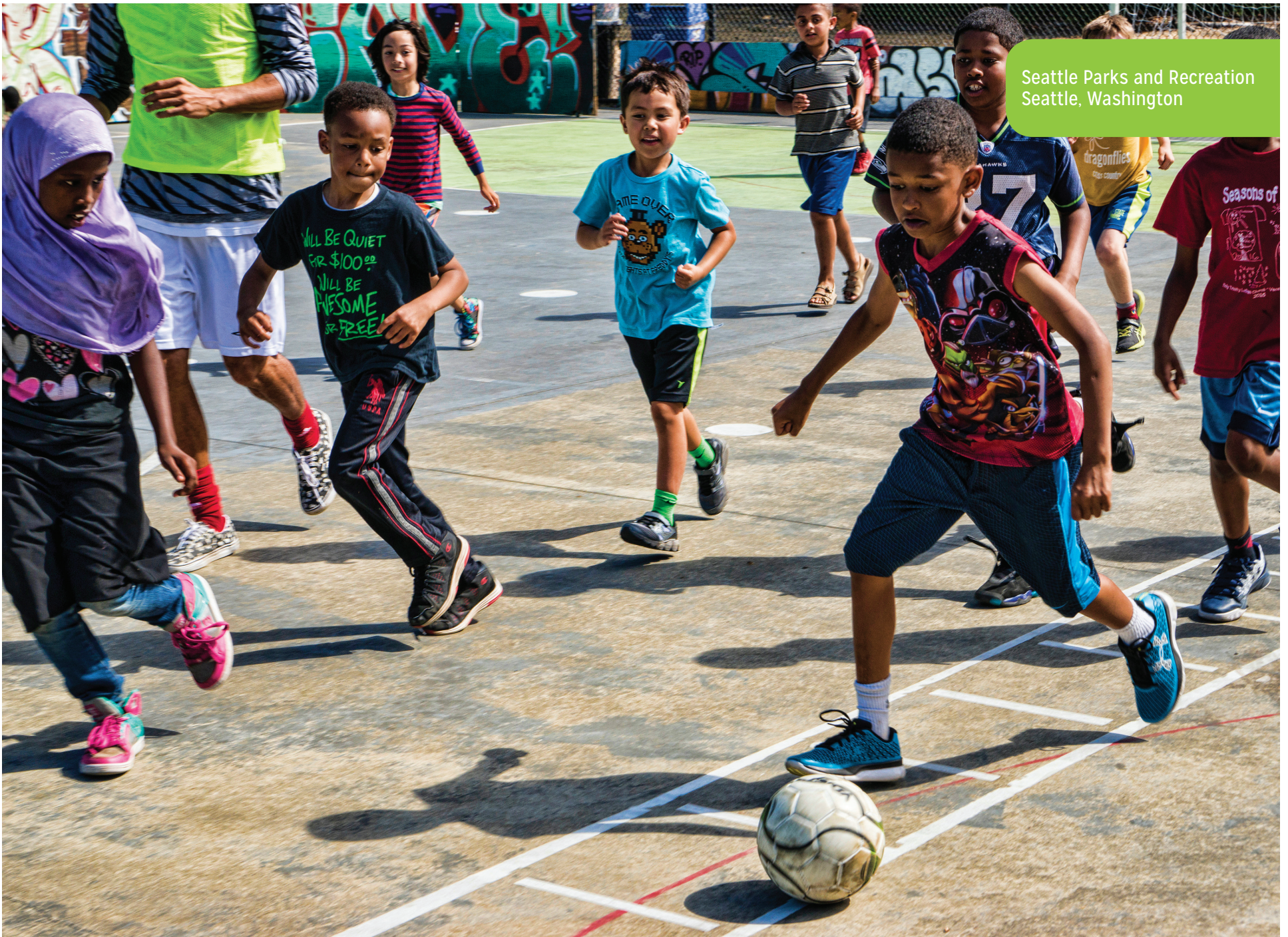
Local youth playing a game of futsal in Judkins Park.