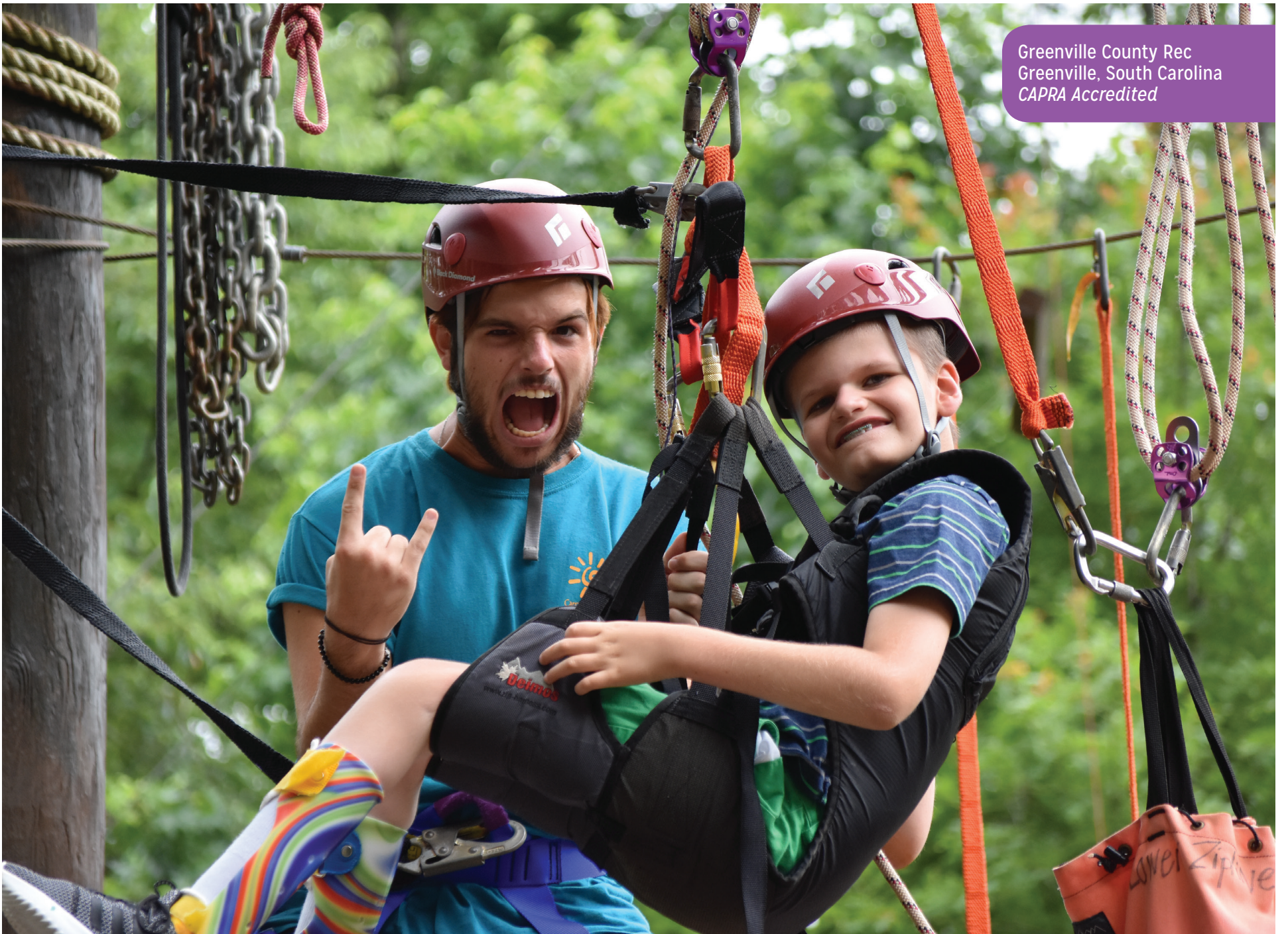
Nothing is impossible at Camp Spearhead.

Greenville County Rec Greenville, South Carolina CAPRA Accredited