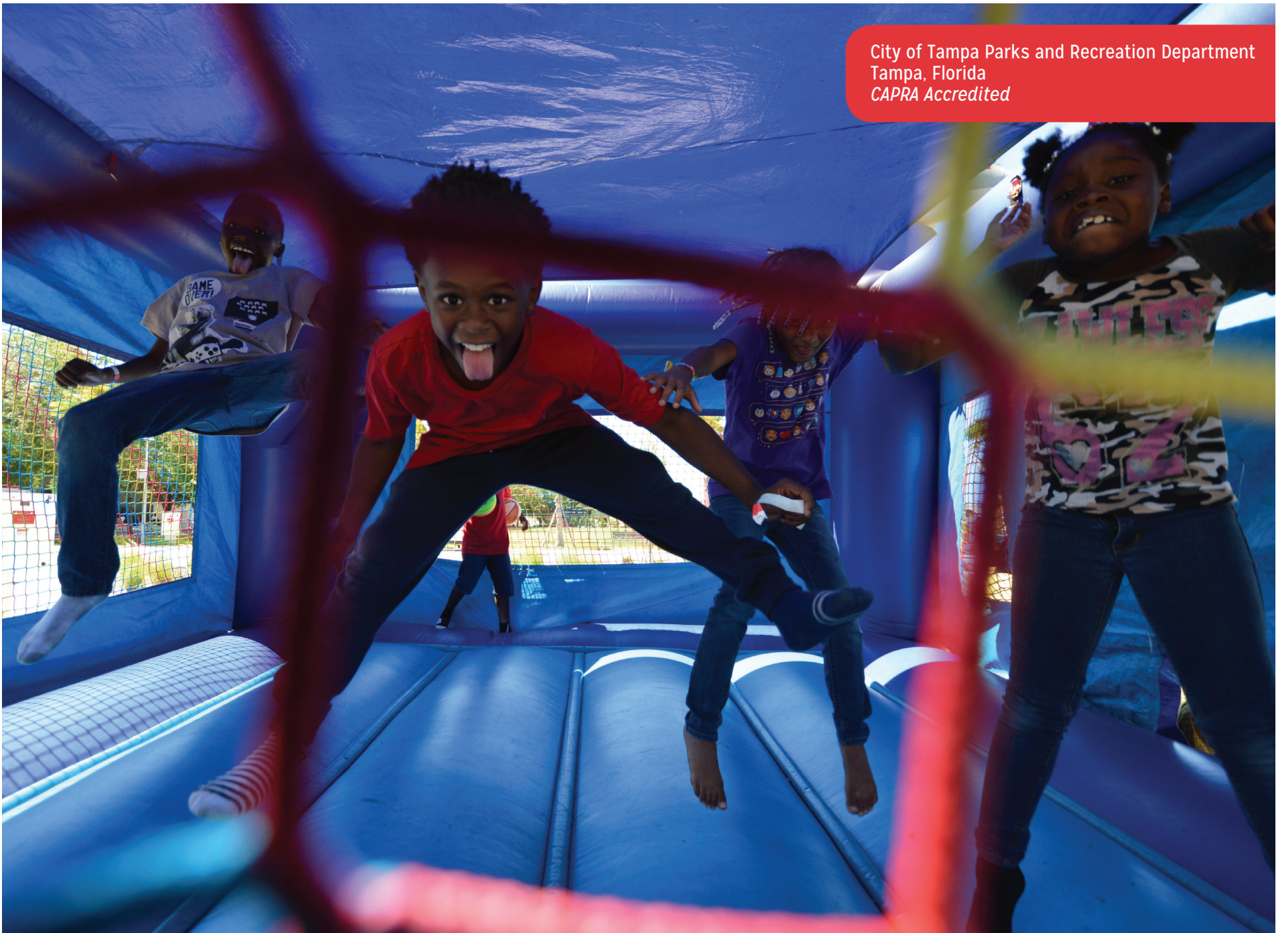
Bounce house fun during a spring event at the Julian B. Lane Riverfront Park.