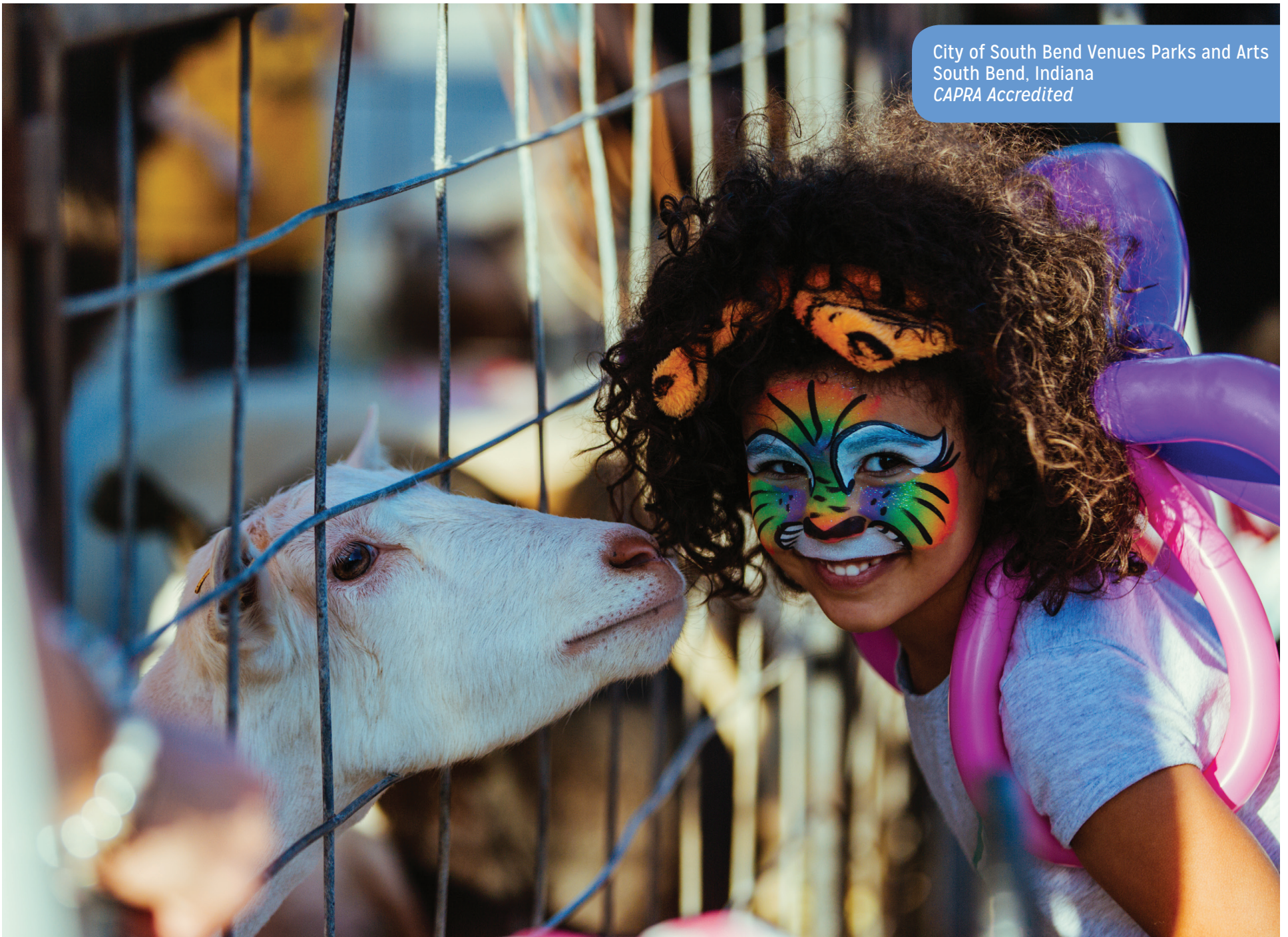
A young butterfly enjoys her time at the petting zoo during Best Week Ever 2019: Kids' Night Out in Downtown South Bend.

City of South Bend Venues Parks and Arts South Bend, Indiana CAPRA Accredited