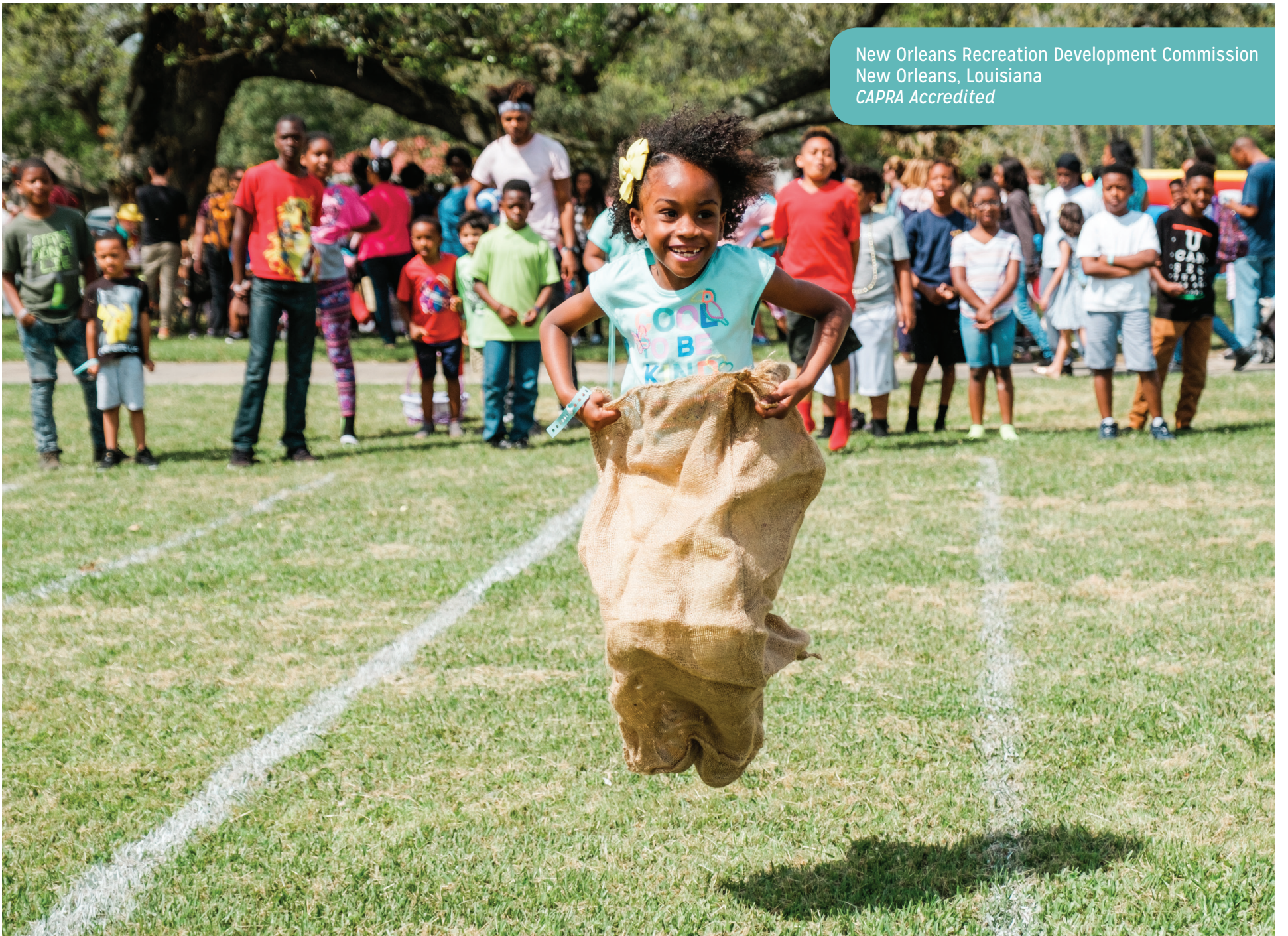
Hopping to the finish line at the New Orleans Annual Easter Eggstravaganza in Behrman Park.

New Orleans Recreation Development Commission New Orleans, Louisiana CAPRA Accredited