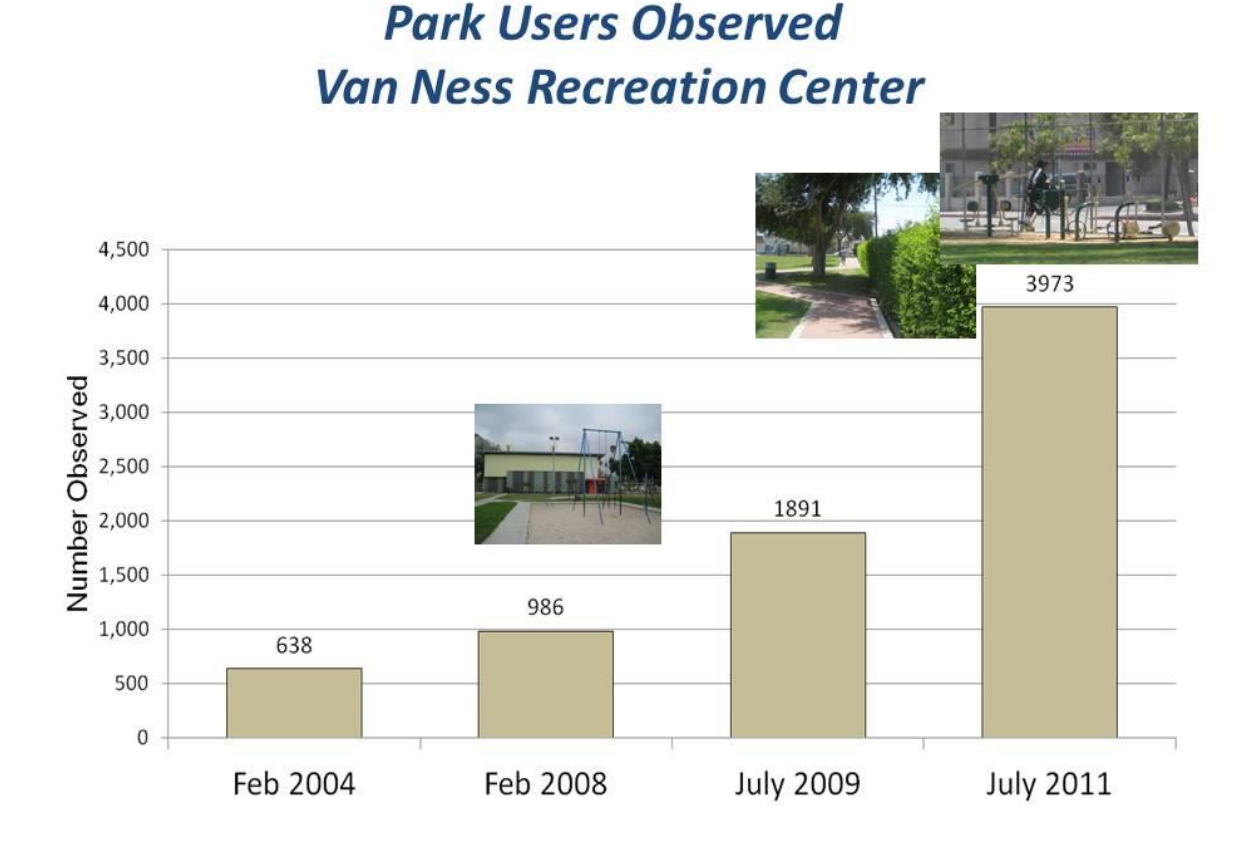
Figure 3. Changes in Park Use Over Time, Adding a Gym, a Walking Path, and Fitness Equipment

Section 4 describes the use of SOPARC in detail.