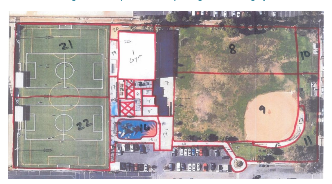
Figure 5. Example of Park Map Using Satellite Imagery