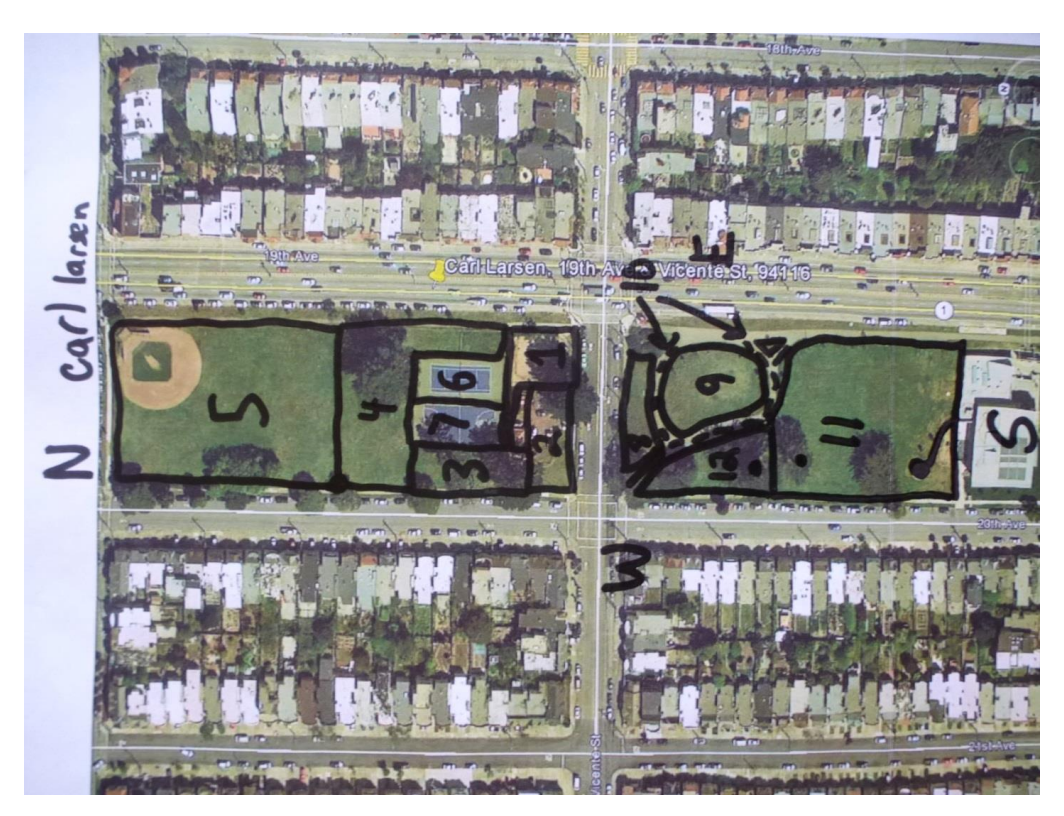
Figure 1. Target Area Map of Carl Larson Park, San Francisco, Spring 2014

In a recent national study, we visited 172 parks in 25 cities. Local data collectors mapped these parks using satellite imagery from Google Maps. Figure 1 is a picture of one park in San Francisco with 12 target areas. The bar charts in Figure 2 summarize what was observed on the four days and times the parks were visited. This information represents a snapshot of park use.