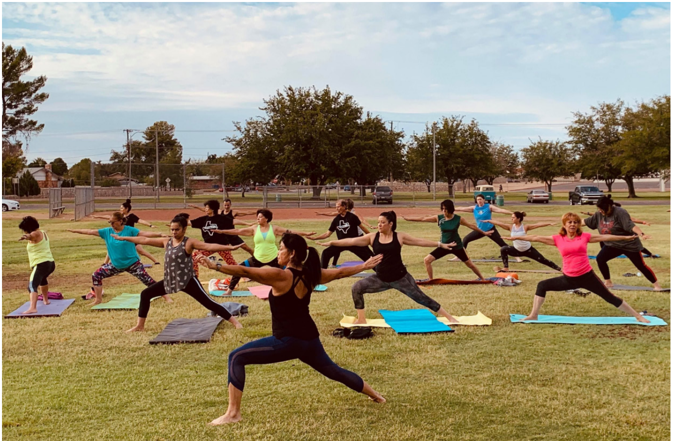
Community members participate in a yoga class held by El Paso Parks and Recreation.