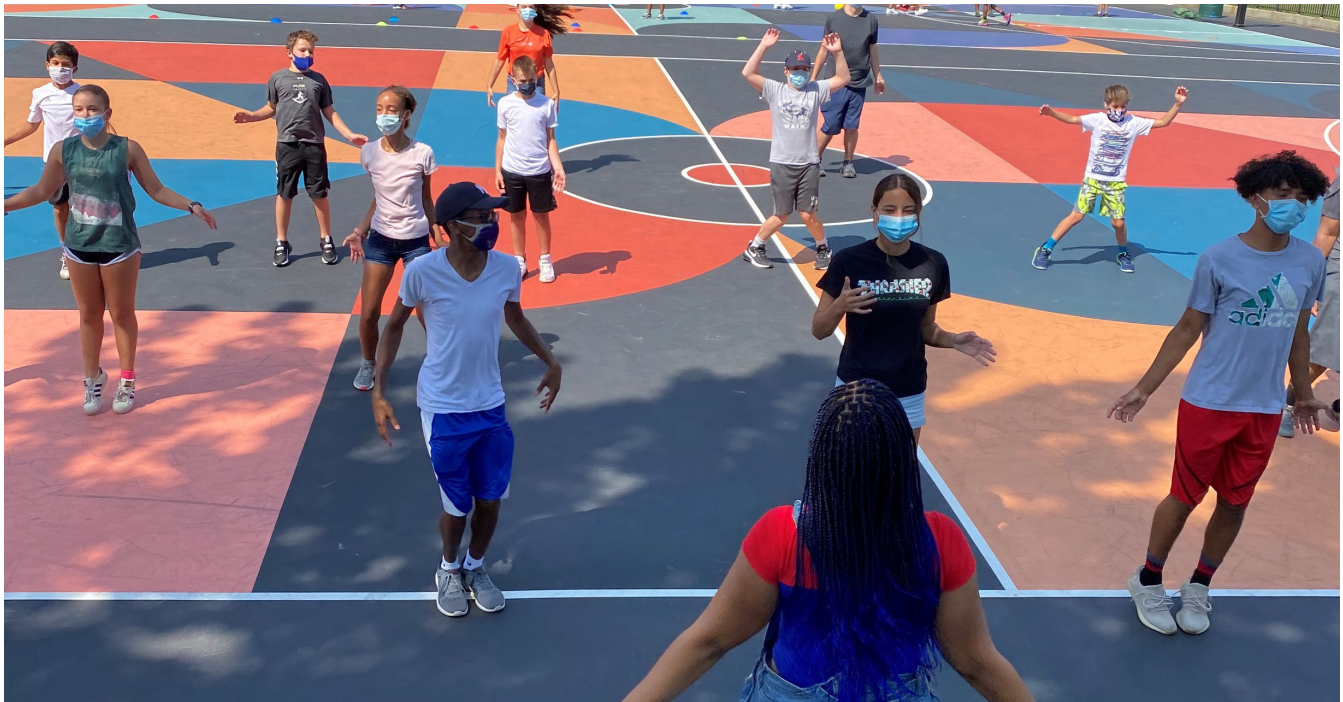
Park and recreation staff in New Rochelle, New York, formed “Outside the Box in Our Parks” during the COVID-19 pandemic to provide safe recreation and fun activities for youth when almost all other activities were canceled.

Whether creating new or refining ongoing programming to improve access and quality, your action plan needs objectives related to engaging the community in program design to help ensure the community is represented in programming. Leveraging the community engagement strategies mentioned in this guide can support bringing together a diverse group of voices to help ensure all community members feel welcome in and benefit from programming. 43 Consider including action plan objectives related to the continuous evaluation of all physical activity programs to measure program impact and reach, health outcomes, and community member satisfaction. Keep in mind that people of color, people with lower incomes, people who are LGBTQ+, and people with disabilities face additional barriers to access programming, so it is important to develop, implement, and refine programs to keep their needs and desires top of mind.